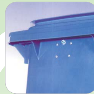
STANDARD LID LOCK