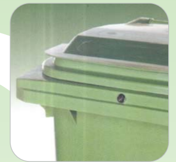
BARREL LID LOCK