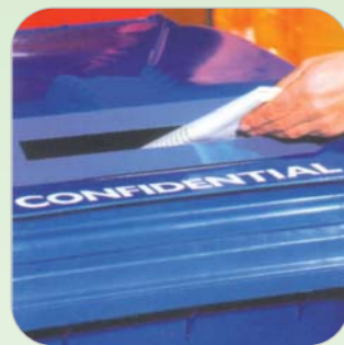
CONFIDENTIAL PAPER SLOT