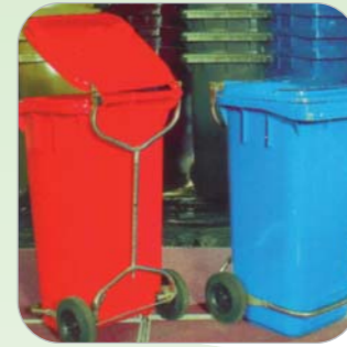
2 WHEEL LID LIFTA