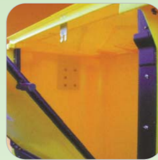
DROP DOWN DOOR