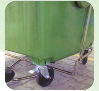
4 WHEEL LID LIFTA